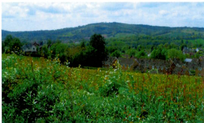
From Agincourt Road

In conclusion as to the question of Amenity Value, this is a standard term used in evaluating trees in the landscape. The noun amenity in this sense equates with pleasantness or attractiveness and whether the loss of a tree detracts from this. I have attached some photographs which show the tree to be visually prominent from a number of viewpoints.