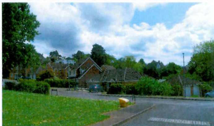
From Berryfield Close