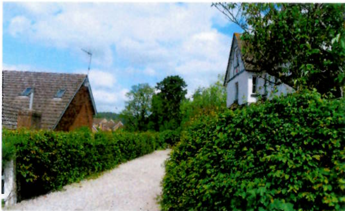
From Highfield Road