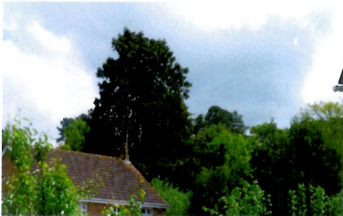
From Berryfield Park